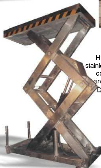
4 ton Heavy Duty Hydraulic platform with stainless steel cladding for copper manufacturing plant of Sterlite Industries, Duty Cycle continuous