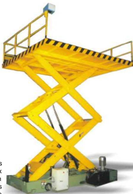
2 ton hydraulic goods platform Size 3300 x 2700 mm for use at Yamaha Motors warehouse