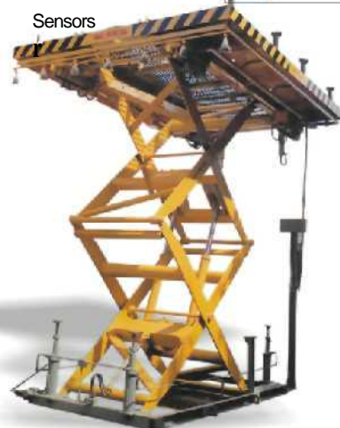
3 X 2.5 m Heavy duty Hydraulic scissor platform with auto trolley lock & photo sensors for use at TELCO car / truck body paint shop at TELCO, Pune Duty cycle 6 min. continuous

Note: Operation is by 415 VAC Hydraulic power pack. Dual controls, railings, doors, guides, interlocks are optional. Pit depth varies for different models.