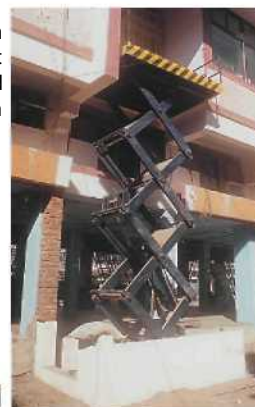
2 ton hydraulic platform (2m X 2m ) for use at Departmental store to load goods from Lorry to Stores directly.