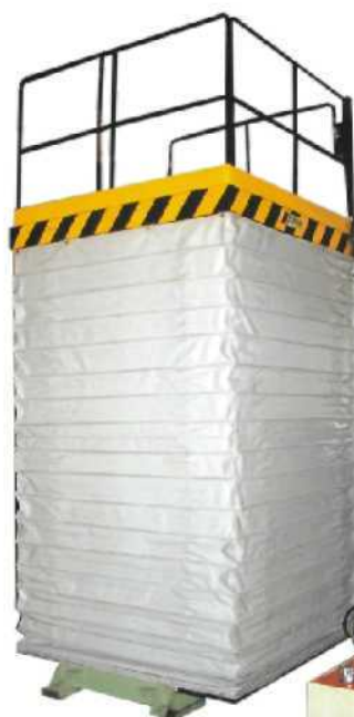
Platform Size 1500 x 1500 mm hydraulic triple scissor platform with Bellows cover for use in paper processing plant of ITW Signode.