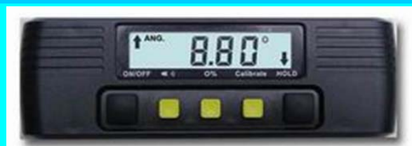
DP01A (Heavy Steel Base) L. C. 0.1°