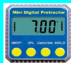
MDP - A (ABS Body) L. C. 0.1°