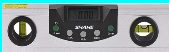
DLI (With Infra-red beam) L. C. 0.05°