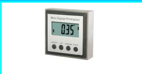
MDP - S (Steel Body) L. C. 0.05°